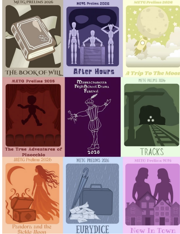
A promotional infographic that was posted on the METG website via the St. John's Prep theater's Instagram site lists the names of the entrants into this year's One-Act Play Drama Festival.

Students must also navigate strict festival guidelines. Productions are limited in running time and must set up and strike their sets within tight time limits.