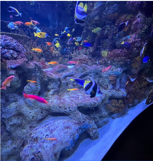
(Arrangement of fish in a tank at the Boston Aquarium by Sadie Deveau).