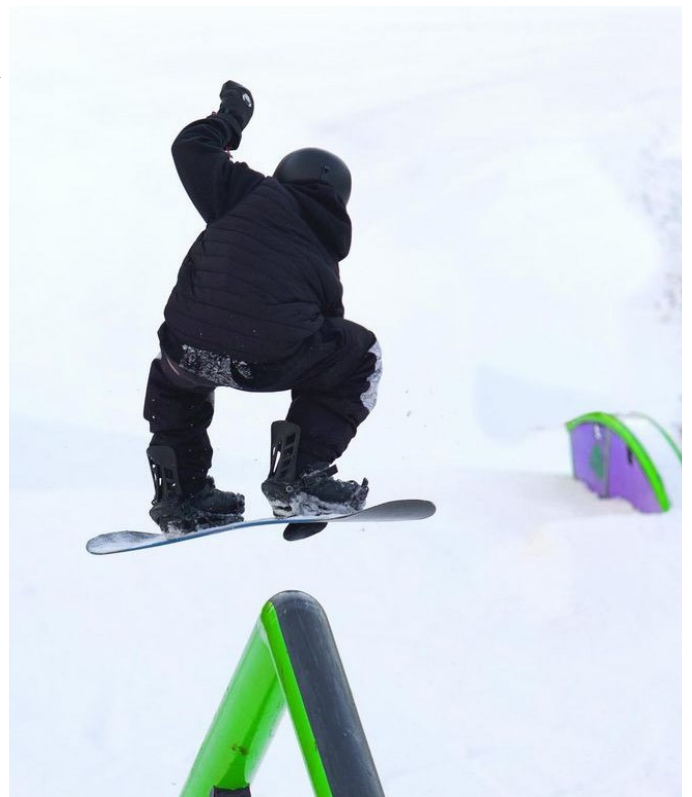
The author hits a jump on a recent snowboard trip (Balkus photo).

his leaves us with the question: what is the best place to ski the East? In all honesty there really is no right or wrong answer. If you enjoy skiing a larger mountain with more trails available for harder terrain then going farther up north is a better option. And if you are a beginner or strictly like to ride terrain parks for a quick day trip, closer mountains like Crotched and Gunstock are very easy options..