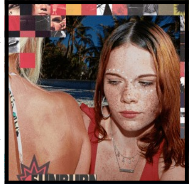
Sunburn Cover/Columbia Rec.

guitar and is by far the most upbeat song on the album. "Think Fast" is very different, with a very slow melody and vocals that almost sound like a dream. The difference of these two songs adds depth and authenticity, showing that Fike may be happy at one moment and sad in the next.