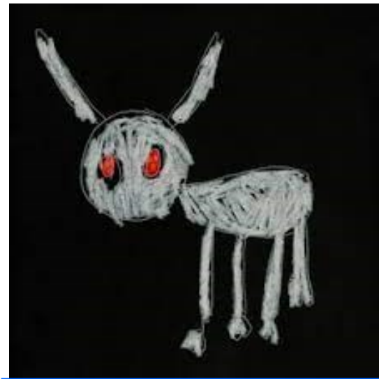
Album art courtesy Ken Carson (left) (pitchfork.com) and Drake (right) (genius.com)

Many fans took to social media platform Reddit and had things to say like, "Drake is just straight up boring. Hasn't put out an exciting