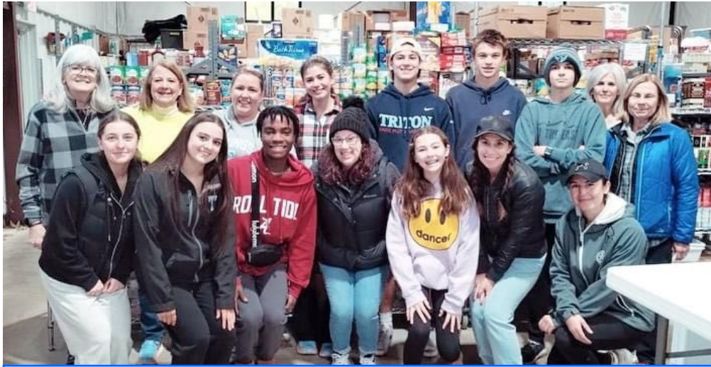
Picture of students from the community service club at Triton High school, and other volunteers who helped unload and organize donations from Triton's annual "Stuff A Bus."

As the church started to reopen for in-person services after the pandemic, the pantry took refuge in the garage of a family in Newbury.