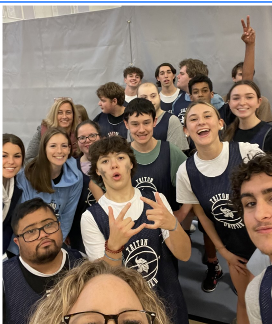
Post-game with the Triton Unified Basketball Team.

After thorough listening and research, Carson's A Great Chaos stands out as an above-average project, surpassing his previous works. The album, ranging between a high 7.5 to a solid 8, owes much of its appeal to the electric production. While the album's vocal performances contribute significantly, it's the production that elevates it to a unique status. Despite occasional lyrical ambiguity, the overall impact of the album is undeniable, cementing Ken Carson's place in the realm of rage trap and hip-hop.