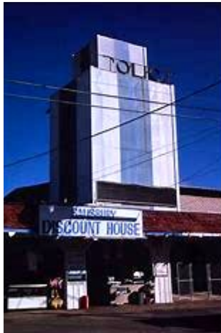
The once-great Frolics entertainment venue had moved past its heyday by 1980