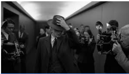
Oppenheimer faces criticism after accusations of working for the communist party (photo credits: Medium Movie Reviews).