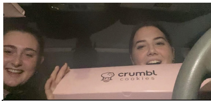
The authors are ready to open their Crumbl Cookies box.