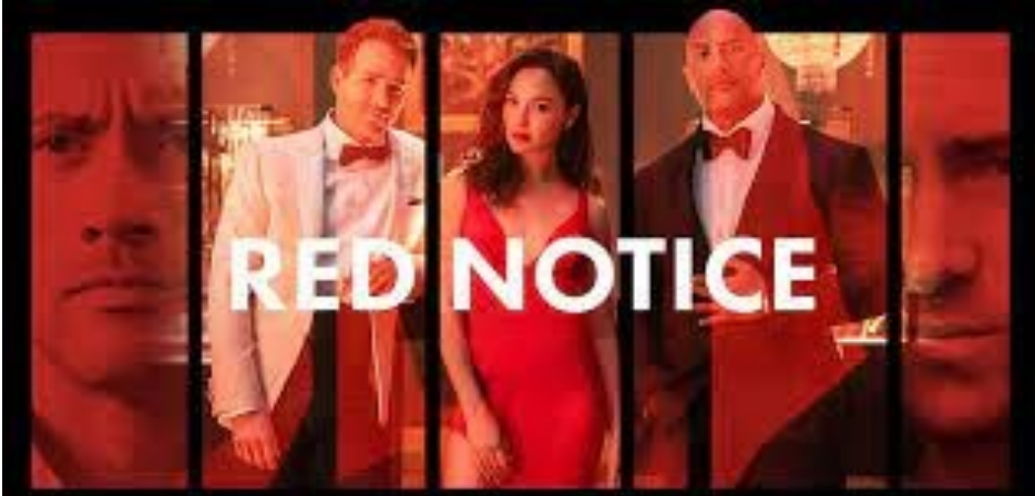
Red Notice Movie Poster featuring it's stars, Dwayne Johnson, Ryan Reynolds, and Gal Gadot.

3 eggs between them, this is when the film really takes a turn for the worse. After Nolan has the 3rd egg, he is overjoyed because he has a friend who he is willing to sacrifice a lot of money for, and he gets to see his nemesis fail. However, he finds out that the Bishop and Hartley are actually working together