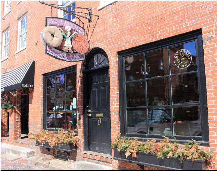
Abraham’s Bagels: a popular local business in Newburyport MA.