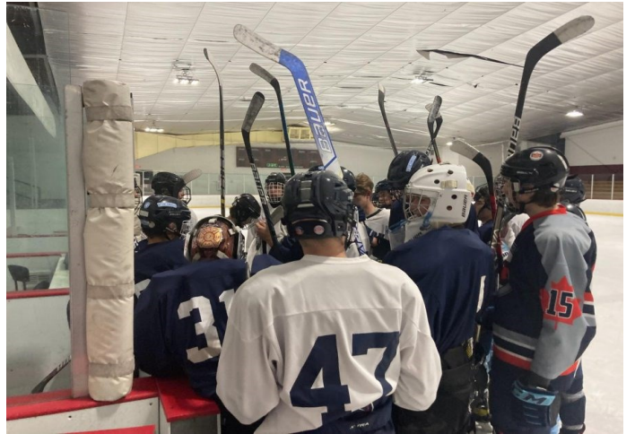
The Triton hockey team huddles up after a hard practice. (Pearson Photo).