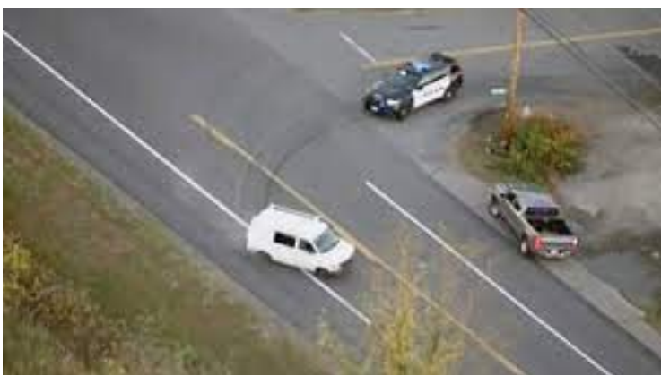
Salisbury and Massachusetts state police were engaged in a high-speed pursuit on Monday, November 1st.

Around 10 am Monday morning, he robbed the Bangor Savings Bank in York, Maine. He showed a weapon before leaving with an unknown amount of money. He proceeded to head back to the Newburyport area.