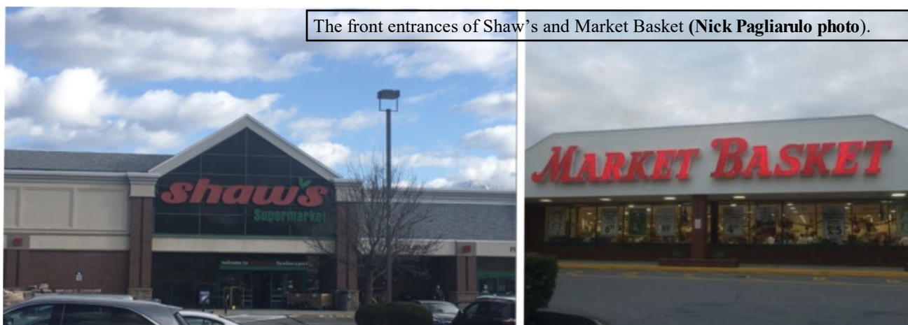
The front entrances of Shaw's and Market Basket.

So which movie is better? Both have unique plots in their own ways, maintaining details such as Anna and Kristoff's relationship, and of course Olaf. When it comes down to it, however, I think that while Frozen was more of an introduction to the storyline, Frozen 2 has a plot that engages the viewer a bit more with many twists and turns and a faster pace that keeps them engaged.