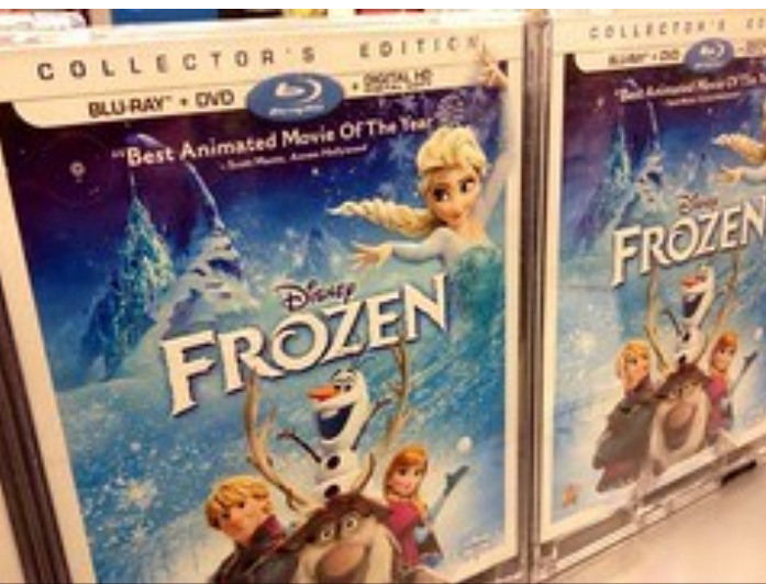
Frozen 1 on DVD is still being sold all over the country.

Frozen 2 is the ideal movie to follow up Frozen . I admire that the writers did not try to mimic the first movie by tiring out old themes from the first. Instead, they created a whole new storyline that tied in details from the first movie and expanded upon them more. I won't give any spoilers because the movie is still fairly new, but one of the best aspects of the movie was how they gave more of a backstory to Elsa's parents. All we knew in the first movie was that they tragically died in a shipwreck. In Frozen 2 , we learn more about their death and backstory. In Frozen , Elsa becomes truer to