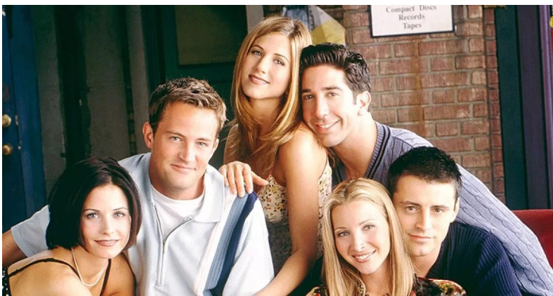
The cast of the iconic 90's sitcom, Friends.

Friends , an NBC sitcom released in 1994, is being pulled off the streaming service Netflix at