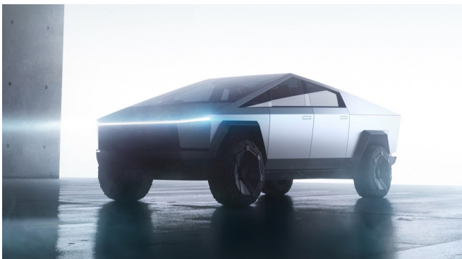
The Cybertruck with its impressive light bar spanning the entire front of the truck ( tesla.com/cybertruck ).

On November 21st, Musk presented his newest invention to the world. The Cybertruck. With sustainability being the main goal of this innovative pickup, it can do a lot more than moving furniture. Its top-end model can go 0-60 in 2.9 seconds and has a top speed of 130 mph, being displayed in a drag race with a Porsche 911 where the Truck defeats the sports car with ease. Along with a range of 500 miles between