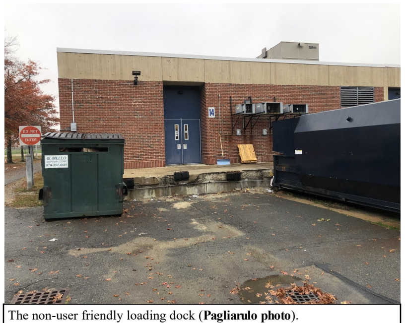
The non-user friendly loading dock.

"The contractors are still in the process of analyzing, and I am sure their will be more visits," said Walsh. "The goal to get this project started is going to be within the five-year range."