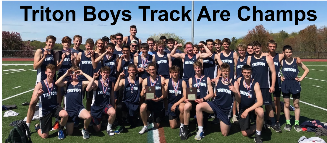
The Viking boys have had a successful season and are rounding the last stretch in spring sports these past few weeks. Several athletes qualified for the state tournament this past weekend, where the Vikings continued their dominant run, winning the Division Four state title for the first time in school history. This historic performance is the culmination of several years of hard work throughout the program. Four years ago, Triton students didn't have their own track to practice on and they didn't win a single meet. Four years later, those very same freshman have grown into the athletes that led this program to the most decorated season in Triton track and field history.

Looking back, it's incredible to see how far the track team has