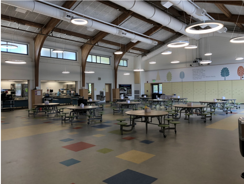
A view of the newly-renovated all-purpose room at Pine Grove School, which includes the kitchen, cafeteria, and stage.