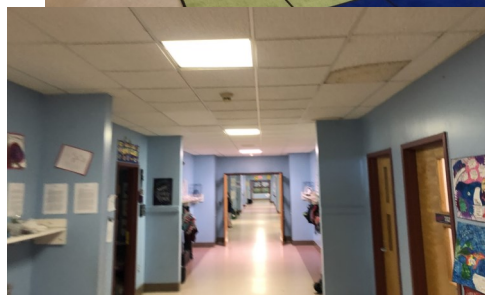
Hallways and rooms flash with light and color in Pine Grove's renovated spaces.