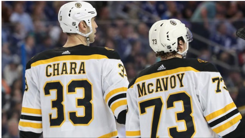
Defensemen Zdeno Chara and Charlie McAvoy have been stalwart in the face of opponents who are usually high-scoring squads. The pair of kept scores low, however, through the playoffs thus far.

Other B's standouts include Charlie McAvoy, number 73, who was drafted to the Boston Bruins in 2016. As a defenseman in the last 54 games of the season, he has 7 goals, 19